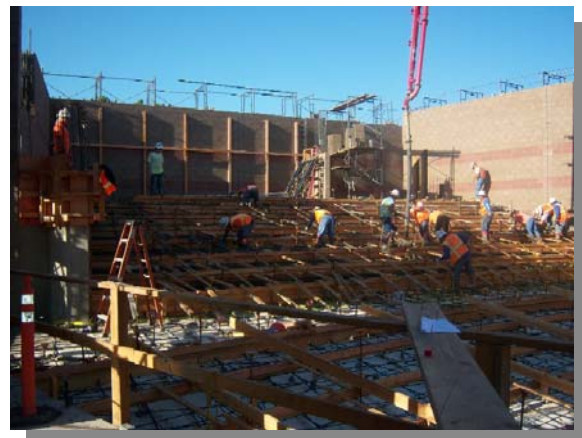
Placing Concrete Steps at Assembly