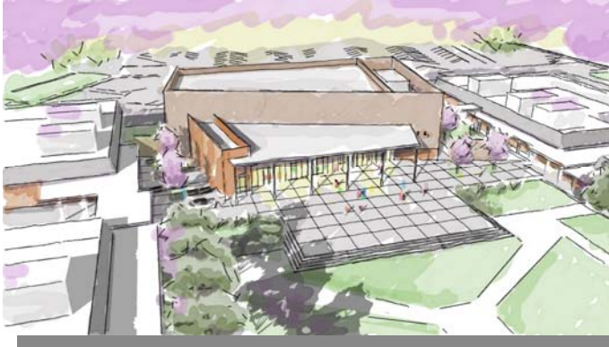
Future Performing Arts Center

Start Date: October 2008 Finish Date: December 2009