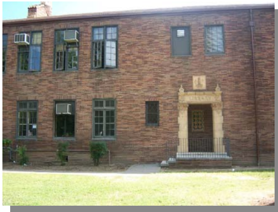
North Elevation of Fremont School for Adults

West Campus High School Fire Loop and Concrete Work: Project cancelled. This work was only required as part of a portable project for the growing school, and the District will not be proceeding with this project as the school no longer needs the portable.