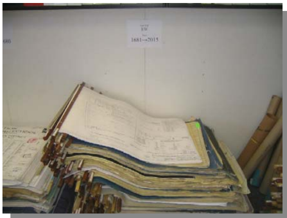
Plans Have Been Inventoried and Stacked in the Facilities/Maintenance Plan Room