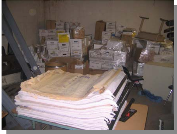
Inventoried of Plans Continues at the Facilities/Maintenance Warehouse