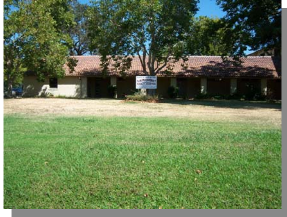
West Wing Roof at A. Warren McClaskey

A. Warren McClaskey Adult School Roofing Project: City of Sacramento plan approval and a permit were received on June 5, 2009, and bid documents officially “hit the streets” on June 19, 2009. The bid date is July 23, 2009, and actual construction is tentatively scheduled to begin September 8, 2009.