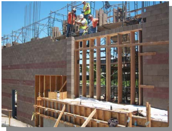
Installing Masonry Reinforcing