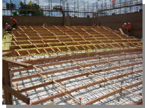
Formwork at Assembly