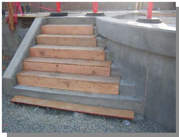
Stairs at Stage