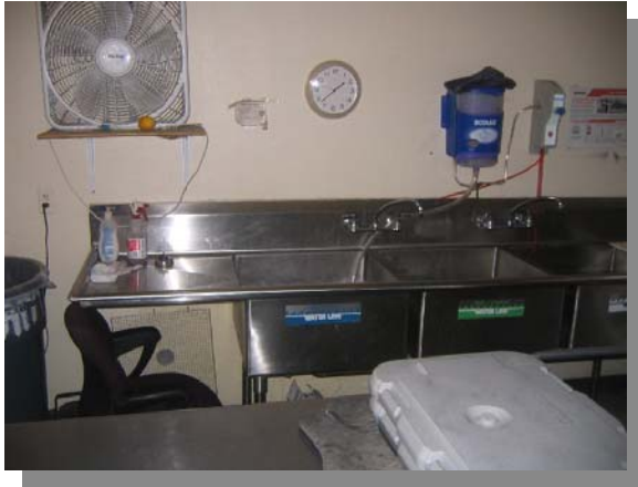
Non GFCI Protected Electrical Outlets Next to Sinks at PS7 and Multiple Sites