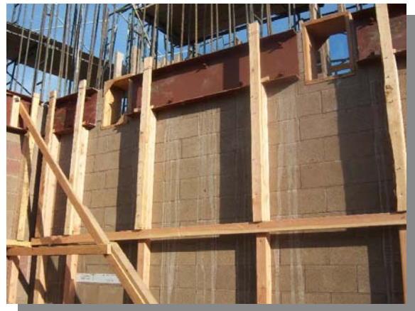
Steel Ledgers Installation