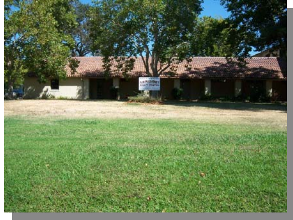
West Wing Roof at A. Warren McClaskey

Scope of work includes water-tight roofing for approximately 20,000 square feet of area served by the school's three high-slope roofs including removal of clay roof tiles, installing new roofing underlayment, and reinstalling existing clay tiles. Plans and specifications have been reviewed by the Facilities Maintenance Department, and these documents will be taken for an "over-the-counter" review to the City of Sacramento on June 8, 2009. The bidding period will follow after plan approval is obtained.