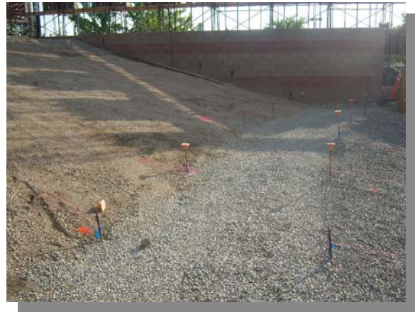
Backfill Installed at Assembly

The John F. Kennedy High School Performing Arts Center is a lease-leaseback project being constructed on the west side of the campus where the old M-Wing portable classrooms were located. The building is constructed on a slab on grade foundation and is comprised of structural steel super structure with masonry block walls. The building includes metal stud framing and stucco finish in the foyer area. The HVAC system consists of rooftop package units, and the roofing system is the District's standard single ply membrane roofing.