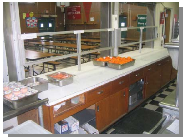
Formica Serving Counters and Wood Cabinets at Caleb Greenwood and Multiple Sites - Health Code Violation