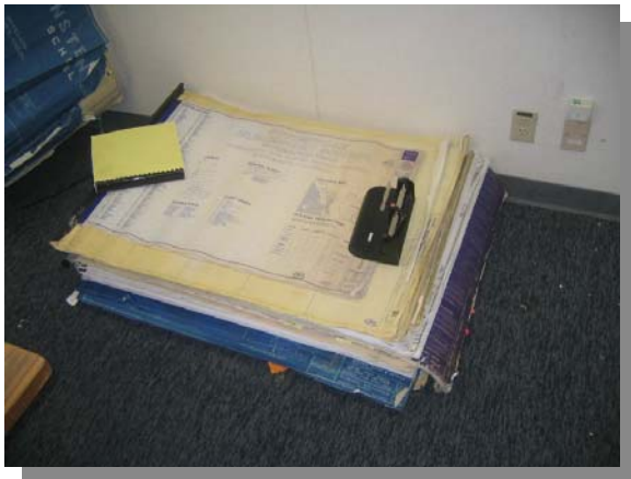
Rolled Plans Laid Out Flat after Being Inventoryed