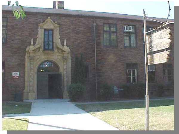
North Elevation of Fremont School for Adults

Scope of work includes the demolition of seventy-three (73) existing windows and the installation of aluminum replacement windows along with all necessary patchback work. Additionally, twenty-eight (28) air conditioning units will be replaced in their existing locations. The architect is due to complete the plans and specifications during the first week of June. The plans and specifications will then be submitted for review to the Facilities Maintenance Department, and the electrical portion of the plans will be submitted to the City for plan approval.