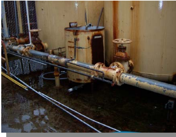
Pool Equipment at Sacramento Charter HS