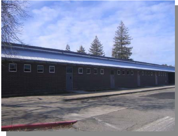
Exterior North Side

Start Date: August 2006 Finish Date: January 2009