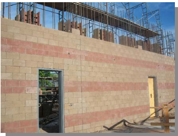
Interior Masonry Wall