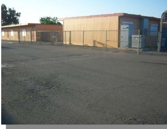
Future Portable Location at Luther Burbank