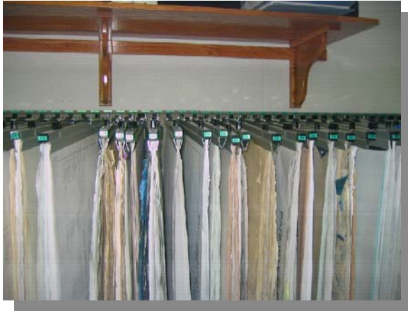
Plan Racks and Sticks Organized During Inventory Process