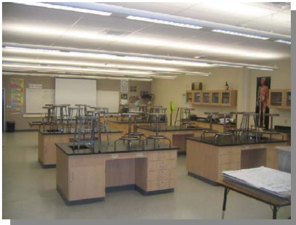
Occupied Lab Classroom