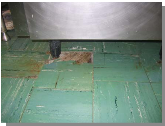
VCT under Kitchen Equipment at Phoebe Hearst