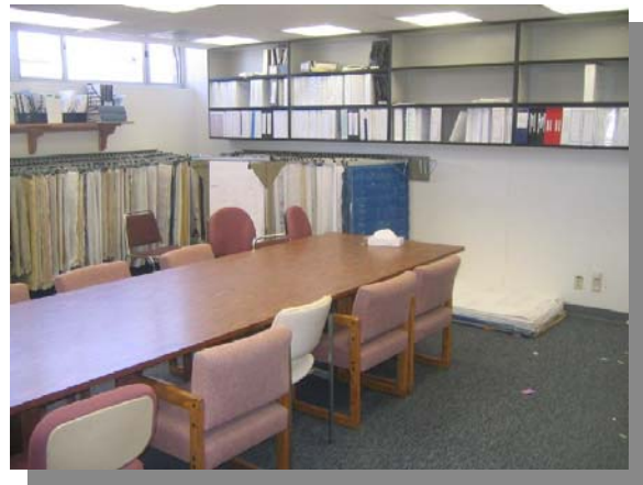
East Wall of Plan Room - Previously Lined With Rolled Plans

PCM3 is approximately 75% complete with the inventorying of all the plans in the Facilities/Maintenance plan room.